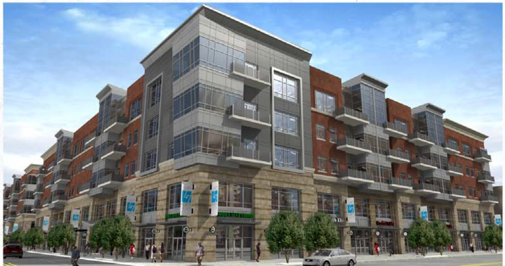
This is a rendering of the proposed Shops and Lofts at 47 development.